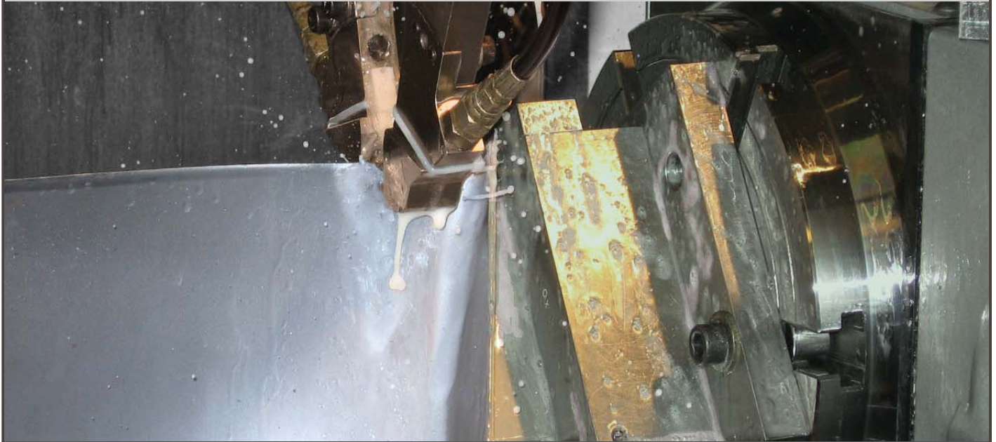
LPB processing of a turbine blade