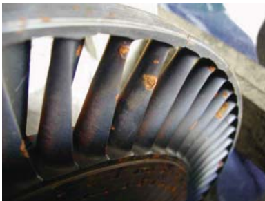
Corrosion Pitting in Steam Turbine Blades

Steam turbines provide 80% of the world's electricity, making them the backbone of power generation. Repeated exposure to high vibratory stresses and extreme steam environments leads to stress corrosion cracking (SCC) and fatigue failure in the turbine blades. Replacing damaged blades costs millions of dollars and can take months. The use of welding and identical replacement parts result in 50% of failures reoccurring. Low Plasticity Burnishing (LPB®) applies a deep, stable layer of compression in high stress areas of turbine blades to extend life and reduce costs.