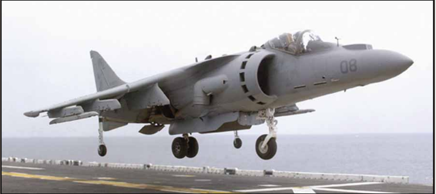
AV 8B Harrier Jet